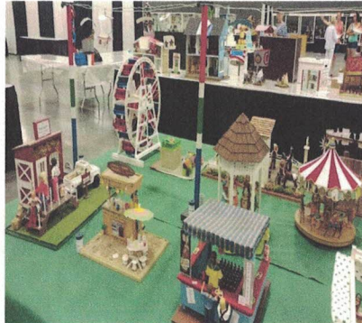
Columbus Miniature Society