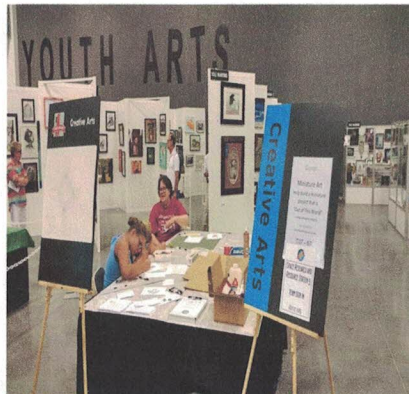
Columbus Miniature Society