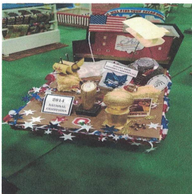
Columbus Miniature Society