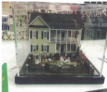
Louisville Miniature Club