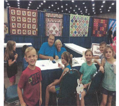
Louisville Miniature Club