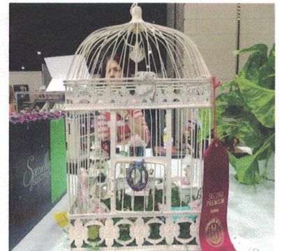
Louisville Miniature Club