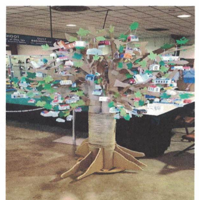
Columbus Miniature Society