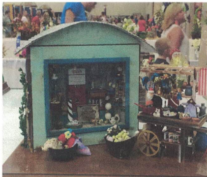
Louisville Miniature Club