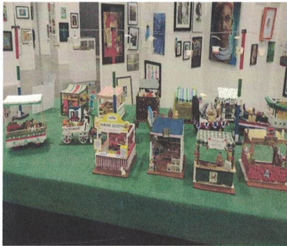
Columbus Miniature Society

Do you have any pictures from your club where you worked at the fair to promote or encourage miniature enthusiasts?